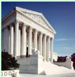
US Supreme Court says ADR is the future for resolving legal matters.

Until recently, all formal disputes and differences between families, individuals and businesses have been resolved by the courts with very little, if any input from the parties.